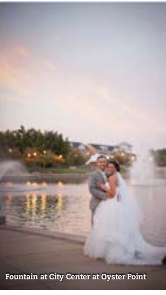
Fountain at City Center at Oyster Point