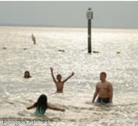
Huntington Park Beach