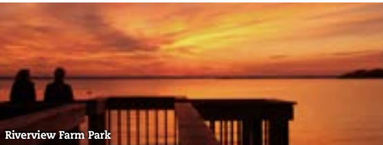
Riverview Farm Park