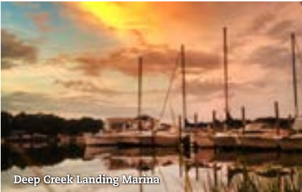
Deep Creek Landing Marina

Warwick Yacht & Country Club 400 Maxwell Lane, Newport News, VA 23606. 757-930-0561. www.wycc.biz/