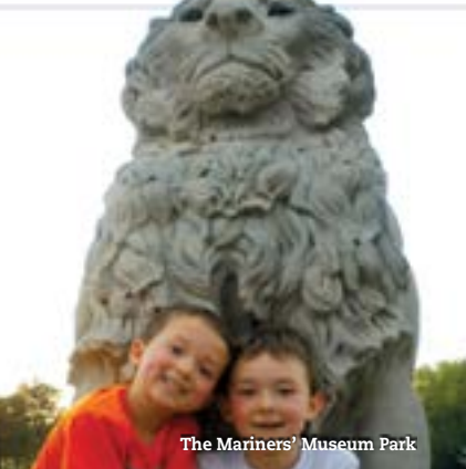
The Mariners' Museum Park