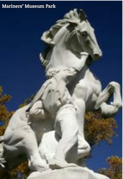
Mariners' Museum Park