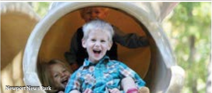
Newport News Park