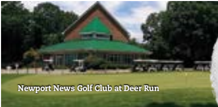
Newport News Golf Club at Deer Run

Kiln Creek Golf Club and Resort 1003 Brick Kiln Blvd., Newport News, VA 23602. 757-874-2600. www.kilncreekgolf.com/ .