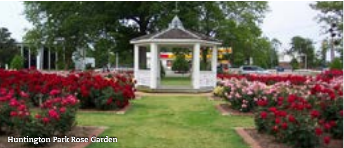
Huntington Park Rose Garden